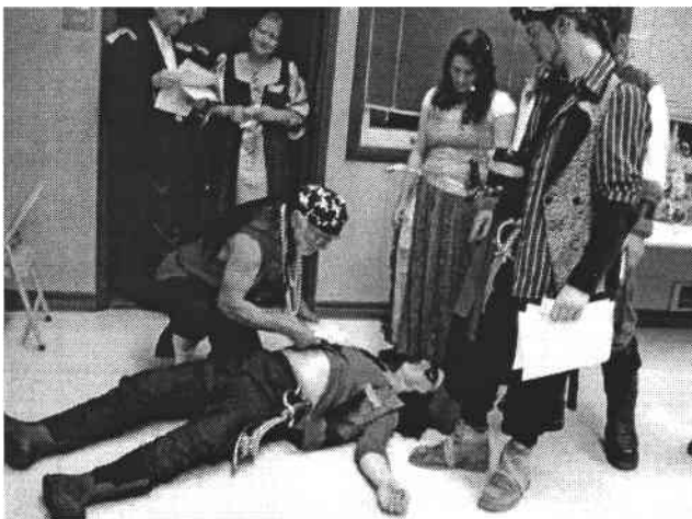
Mystery Dinners. Theler Mystery Dinners are a hit.

Destination events. Theler Center supported local tourism by implementing and expanding major