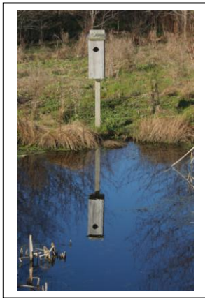
Bird House Reflection (Denny Hamilton.)

This birdhouse is about ¼ mile down the trail and often has ducks swimming under in the pond below.